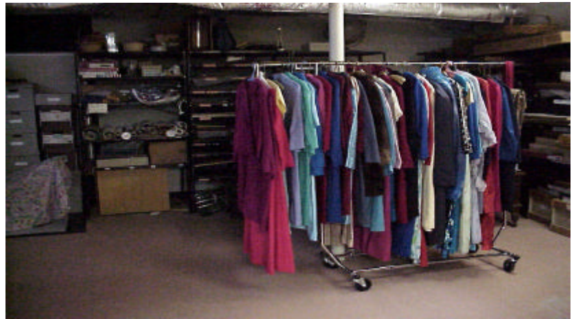
Storage Area After

Tia Nichols is shown above with MCS commemorative wooden coin