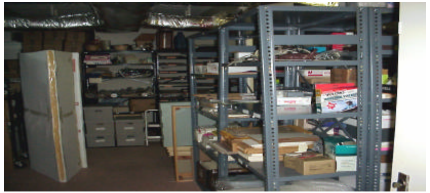
Storage Area Before

This project is by no means complete. The next phase entails adding additional shelving units and repacking the collection using more archivally-approved products. I have already removed the clothing from the plastic garment bags and will make padded hangers using batting covered with poly-cotton material. I will also pad awards and framed items with an archival polyethylene foam instead of bubblewrap, which is coated with an unstable material that can deteriorate and harm sensitive materials. There will be room for a worktable so I can continue to inventory and catalog the collection and input data and images into the PastPerfect database. This minor rearrangement will help in the preparation of a full inventory of the artifacts stored in the basement, will improve intellectual control by way of an updated collections database, and will enhance object care by storing the items in a more secure, stable, and clean environment. I'll share more on this project next time.